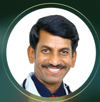
Dr. Y V C Reddy