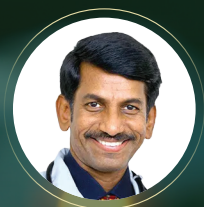
Dr. Y V C Reddy